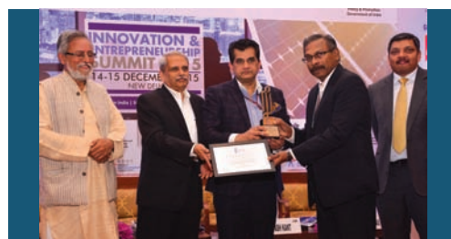
Right Track Admizzionz Campuz Pvt. Ltd.

(Most Innovative Start-up of the year) & Best Start-up in Service Category