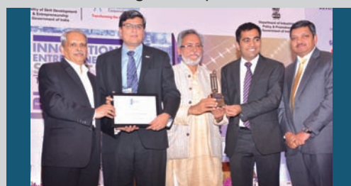
Robert Bosch Engineering & Business Solutions Pvt. Ltd.

Award for Service Sector Large Enterprises