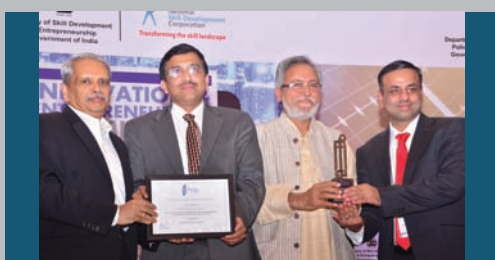
CoreEL Technologies (I) Pvt. Ltd.

Award for Manufacturing Sector Micro & Small Enterprises