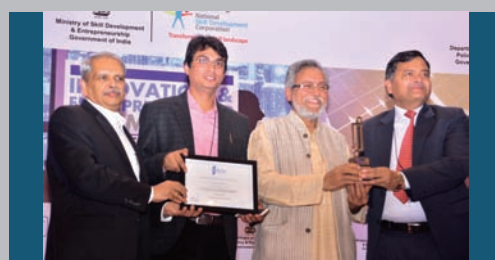
Ananya Seeds Pvt. Ltd.