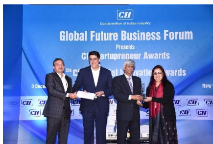
Award for Service sector (Large enterprises) Indus Towers