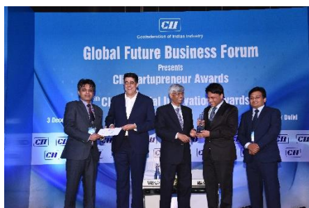
Award for Service sector ( Micro & small enterprises ) ( Joint Winners ) Kale Logistics Solutions