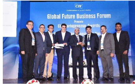
Grand Award Winner & Award for Manufacturing sector (Large enterprises) Mahindra & Mahindra Ltd.