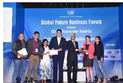
Award for Service sector (Medium enterprise) BARC India