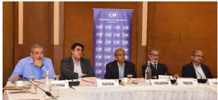
Grand Jury group interacting with manufacturing firms