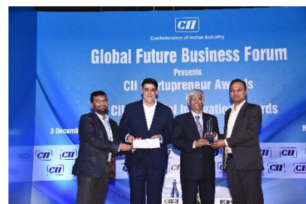
Award for Service sector ( Micro & small enterprises ) ( Joint Winners ) TruckHall Pvt. Ltd.