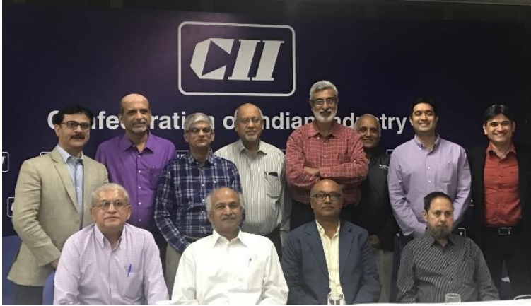
First Jury members in CII office for selecting Top 25 firms