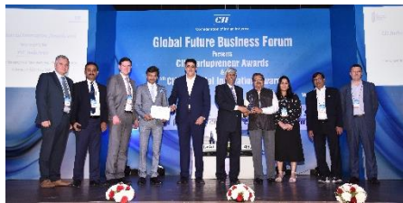
Award for Manufacturing sector ( Medium enterprises ) PTC Industries