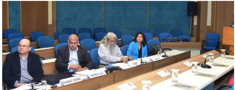
Grand Jury group interacting with service firms