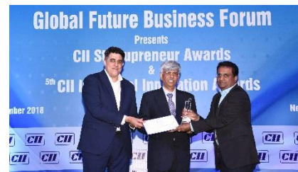
Award for Manufacturing sector (Micro & small enterprises) Stellapps Technologies Pvt. Ltd.